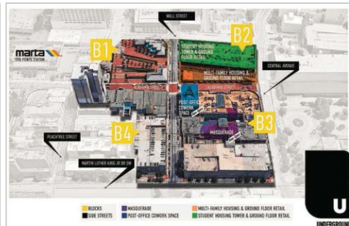
JLL will market a 1.9-acre area, "Block One," of Underground Atlanta's four-block redevelopment. 160 MEDIA

Imaginary Worlds at Atlanta Botanical Garden. Ongoing, Atlanta Botanical Garden, 1345 Piedmont Ave., Atlanta. $21.95/ adult, $18.95/ child, Free for 3 and younger. Take your toes to marvel at this collection of mega-landscaping. atlantabi.org/visit/events/imaginary-worlds