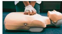
Two free CPR classes will be held June 16 at Five Station 7 at 8025 Holcomb Bridge Road for residents of Roswell.

The classes will be held at 9 and 11:30 a.m., and space is limited to 16 people per class. Instructors with the Roswell Fire Department will use curriculum from the American Heart Association's Family & Friends CPR course. This course is for individuals who want to learn CPR, but